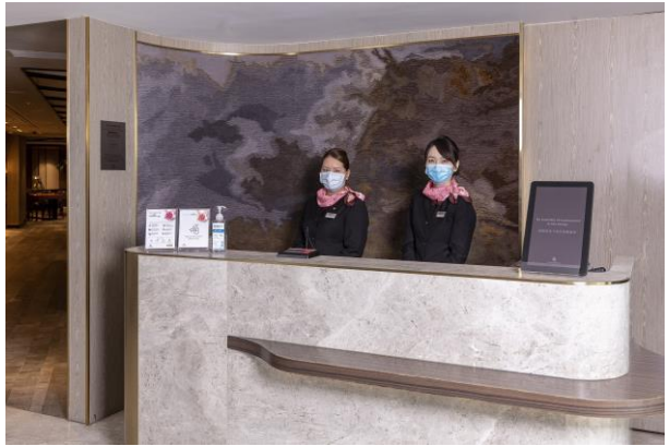
Airport lounges are now an essential service in the airport, as they provide a safe space where interactions with other airport users are minimized