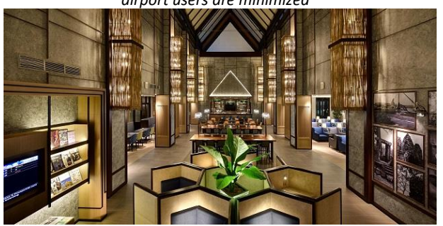
Every Plaza Premium Lounge is different and takes inspiration from local culture, art and design. Pictured: Plaza Premium Lounge at Phnom Penh International Airport, Cambodia