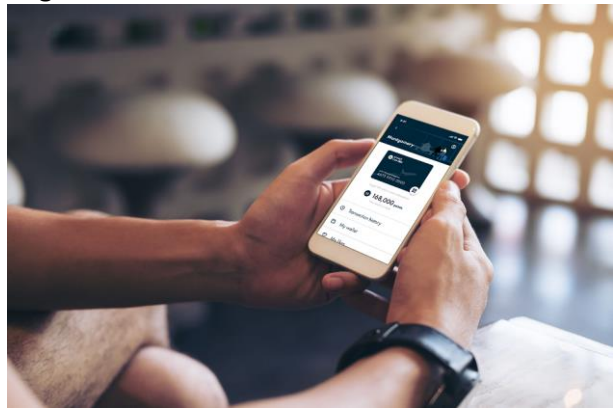
The Smart Traveller app takes users on an enhanced digital journey to maximise their airport experience