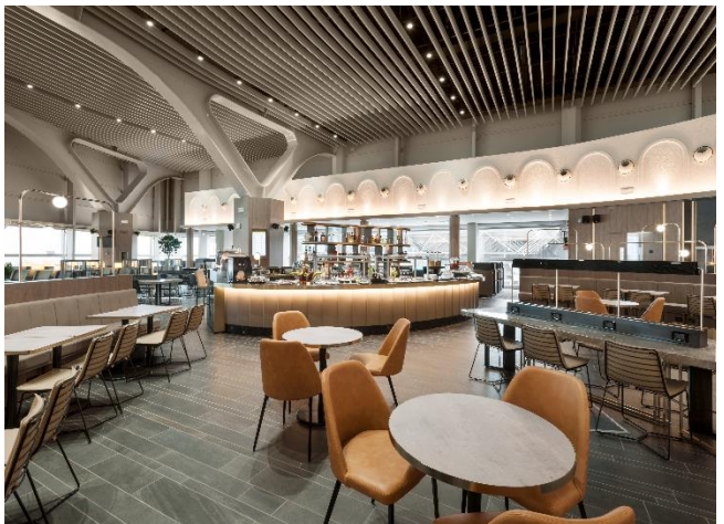
Plaza Premium Lounge, Fiumicino Leonardo da Vinci International Airport

(Hong Kong, 2 November, 2021) Plaza Premium Lounges in London and Rome have been awarded with the highest 5-Star COVID-19 Airline Lounge Safety Rating, by international air transport rating agency Skytrax.