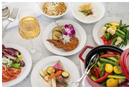
Guests can indulge in a variety of international cuisine and Asian flavors to elevate their journey.