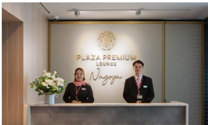
Plaza Premium Lounge at Chubu Centrair International Airport - Nagoya, Japan

Nagoya - Japan, 30 May 2023 - Plaza Premium Group (PPG), global industry leader in airport hospitality, debuts its first location in Japan with the launch of Plaza Premium Lounge Nagoya at Chubu Centrair International Airport (NGO).