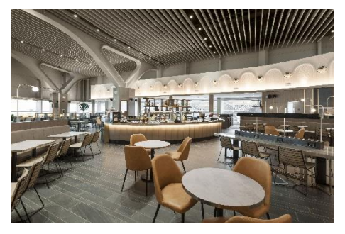
Travellers can savour a fine selection of food and beverages while relaxing at the lounge