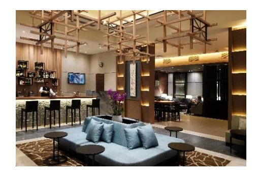
The sleek space focuses on offering detailed and well-designed customer experiences

Plaza Premium Lounge London at Heathrow offers travellers a luxurious and comfortable space to unwind before their flight. Located at Terminal 2 Departures, the lounge features private resting suites, shower