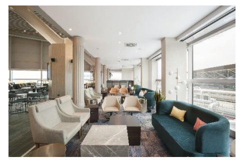
PPL Rome's lounge design drew inspiration from ancient Roman architecture

Plaza Premium Lounge - Leonardo da Vinci-Fiumicino Airport in Italy gives travellers a peek into Rome with influences from the ancient Roman architecture in its lounge design. Travellers get to savour a selection of food and beverages while relaxing at the lounge, and also catch up on work with the lounge's complimentary Wi-Fi and charging stations.