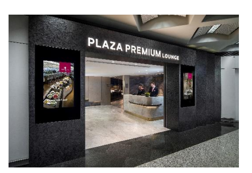
The lounge is conveniently located near Gate 1 at the South Departures Hall in Hong Kong International Airport

NO. 7 - Plaza Premium Lounge Hong Kong – Hong Kong International Airport (HKG-Gate 1 Departures)