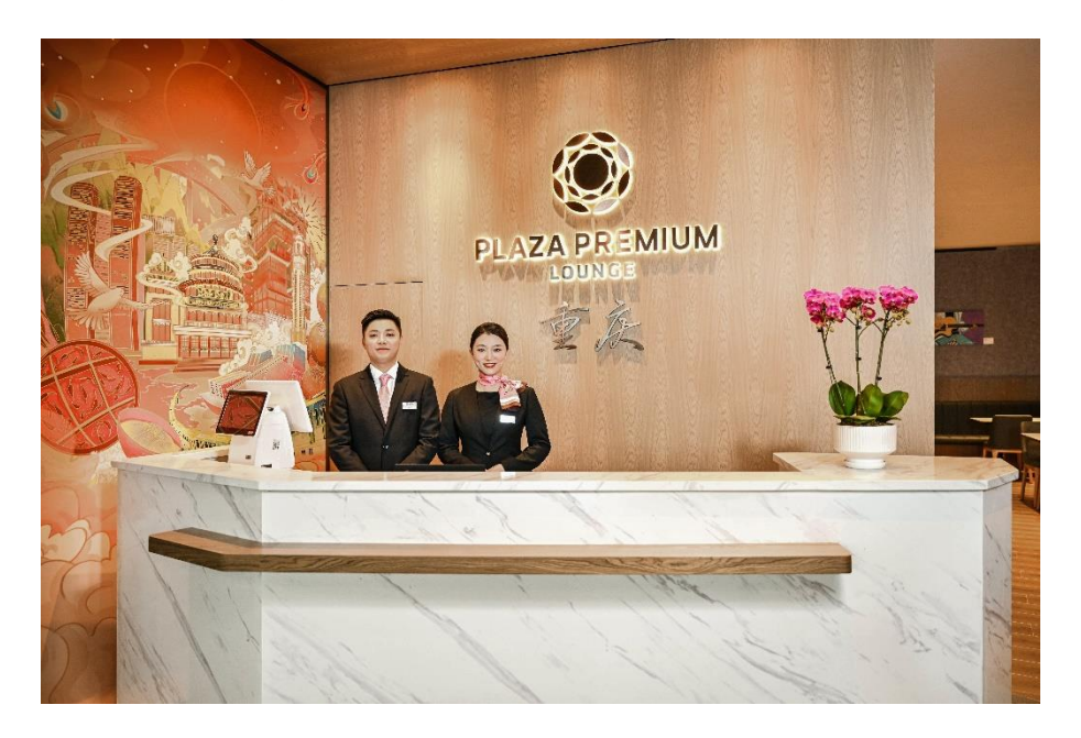
Plaza Premium Lounge Chongqing at Terminal T3A - Pier E

[Chongqing, China - 27 Nov, 2023] - Plaza Premium Group (PPG), the pioneering leader in global airport hospitality, is opening three new lounges at Chongqing Jiangbei International Airport (CKG). This new project marks PPG's debut in Southwest China in its mission to make travel better by strengthening its presence in the Greater China market.